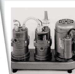
The first vacuum pump