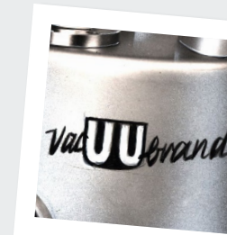
The first company logo