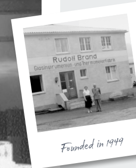
Founded in 1949