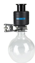
Inlet separator (AK) (20751802)