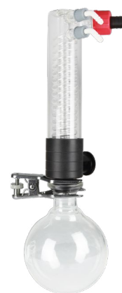
Exhaust vapor condenser (EK) (20751801)