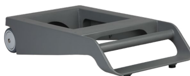
VACUU·PURE shuttle (20751800)